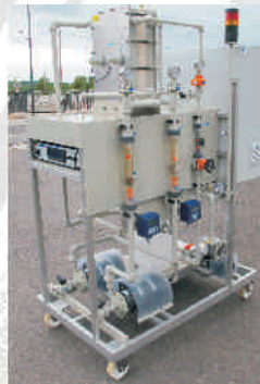
Example of a P10 (external tank pilot unit)